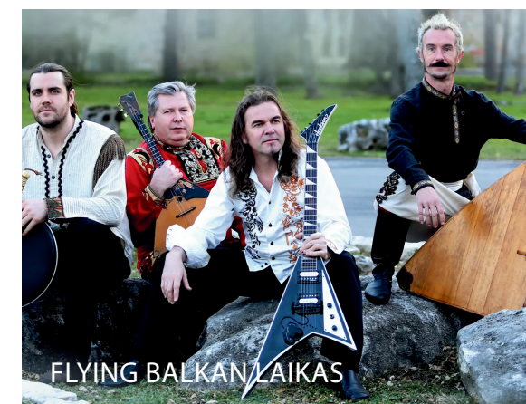
FLYING BALKAN LAIKAS

In putting together the 2022 Lotus Festival lineup, Lotus voices its support for the people of Ukraine and stands against the war currently being waged against the Ukrainian people. Artists such as Puuluup, Lemon Bucket Orkestra, Blato Zlato, and Flying Balkan Laikas represent the rich cultural traditions that spring from Eastern Europe, reminding us that music, art, and culture create a bridge for understanding and appreciation of diversity. Variations of the colors of the Ukrainian flag can be seen throughout our promotional materials and in our Festival T-shirt and pin designs. There will also be opportunities to show support for Ukraine and the Ukrainian people at the festival. For two organizations doing amazing work on behalf of the Ukrainian people, see Razom for Ukraine and Vostok SOS . For more information, visit IU's REEI (Russian and East European Institute) website: reei.indiana.edu