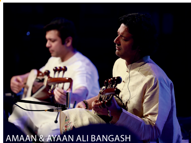
AMAAN & AYAAN ALI BANGASH