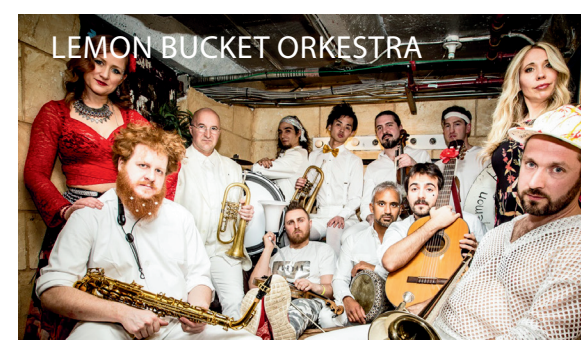
LEMON BUCKET ORKESTRA