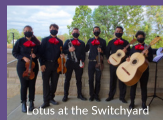
Lotus at the Switchyard