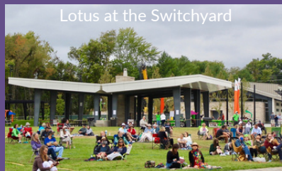
Lotus at the Switchyard