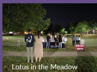
Lotus in the Meadow