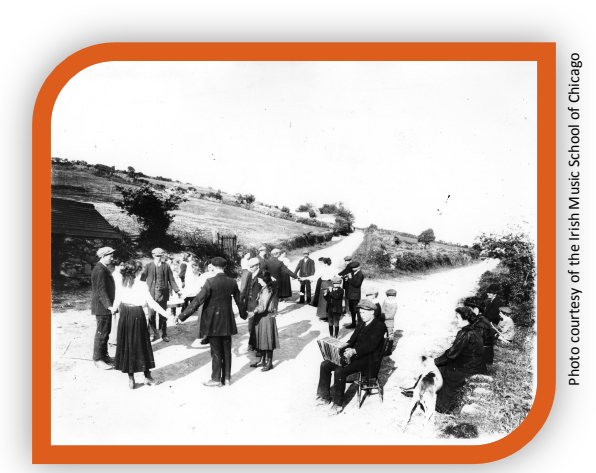
Céili Dance at the Crossroads in Ireland

Céili music may be provided by an assortment of fiddle, flute, tin whistle, accordion, bodhrán and in more recent times also drums, guitar, mandolin, and bouzouki. The